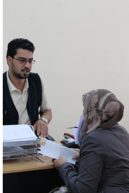
Distributing HA Assistance – intake case/ Caritas emergency staff& volunteers